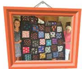
All Star Quilter's Guild provides comfort through remarkable raffle item