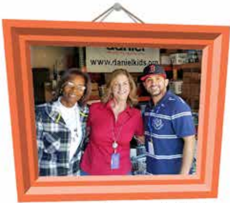
Citi Resource Management gathers supplies for Project Prepare teens