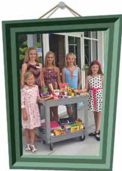
Hometown USA donates school supplies to Daniel Academy