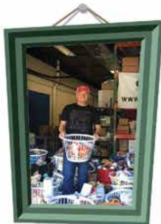
Superior Construction lends support with baskets