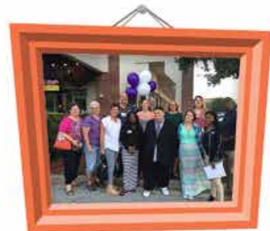
Womenade celebrates Daniel Kids readers