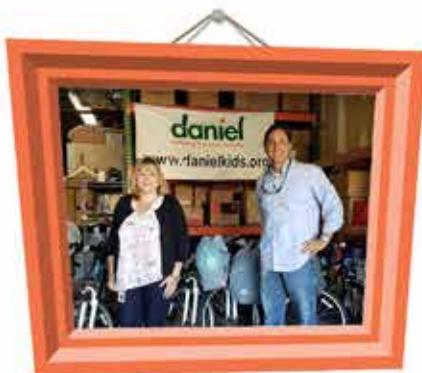
McKesson makes Christmas brighter with bikes