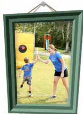
Holland & Knight's 9/11 day of service is a hit with Daniel Kids