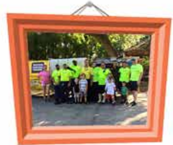
Krystal Kleen makes campus sparkle